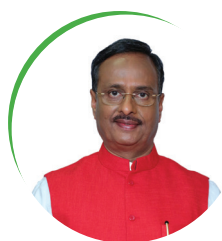
Mr. Dinesh Sharma Hon'ble Member of Parliament, Rajya Sabha; Former Deputy Chief Minister, Uttar Pradesh