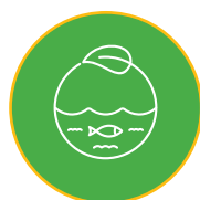
Ocean Health and Marine Life Conservation