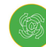
Waste Management and Circular Economy