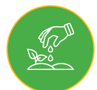
Sustainable Farming Practices