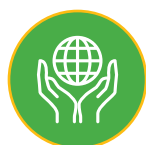
Section 8 Companies