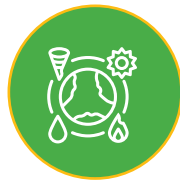
Innovation in Climate Tech