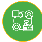
Sustainable Supply Chain