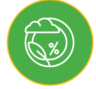
Net Zero Action