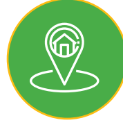
Sustainable Mobility Solutions (Land/Air/Water)