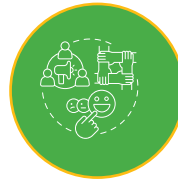
Community Engagement for Sustainability