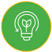
Sustainable Product Innovation

The CASCA 2025 Awards recognize outstanding achievements across various areas of climate action and sustainability, celebrating innovation, leadership, and impact. Categories include: