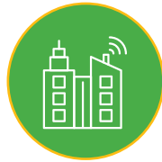
Sustainable Building Development