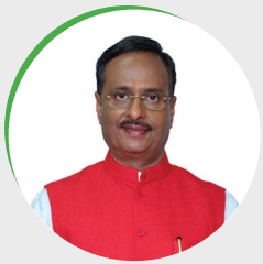
Mr. Dinesh Sharma Hon'ble Member of Parliament, Rajya Sabha; Former Deputy Chief Minister, Uttar Pradesh